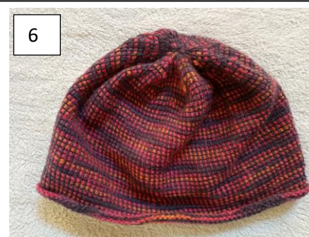
Soft organic wool, men's size