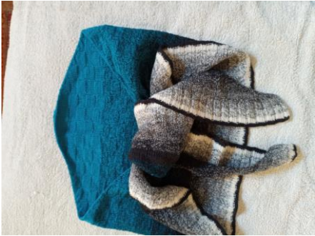
Made from Schoppel Wolle „Zauberperlen“, Yarn cost 33 Euros, Merino Handwash. My own color design based on “Crasys Halbmondschal” (free internet pattern). Uncounted hours, probably close to 50.