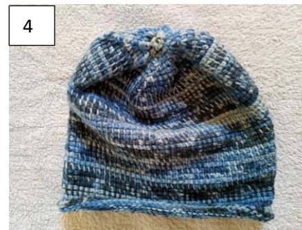
Warm wool, for smaller head

Yarn costs and working hours are given for your information to allow you to estimate an appropriate donation.