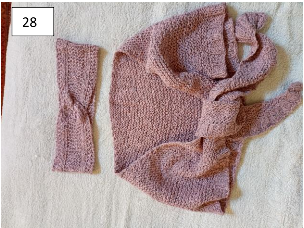
Linen + cotton crescent shaped shawl with matching headband (large size) (fit for summer/autumn) minimum 12 hours