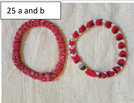
Knitted bracelets, wool + cotton (b) yarn cost small. 3 hours each