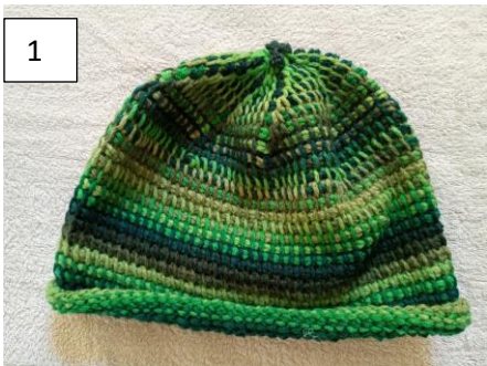
Wool, for a large head (men's size)