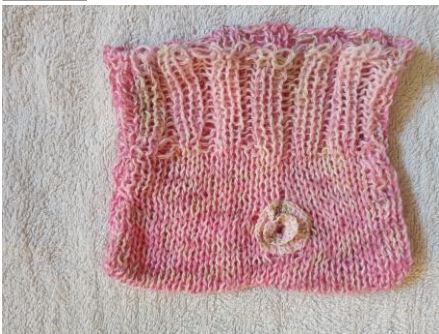
The last of the pussyhats. Summer version for small female head. I don't remember wool cost, probably knit in 3 hours.