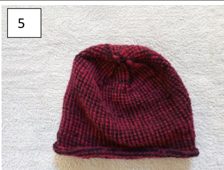
Very soft wool, middle size