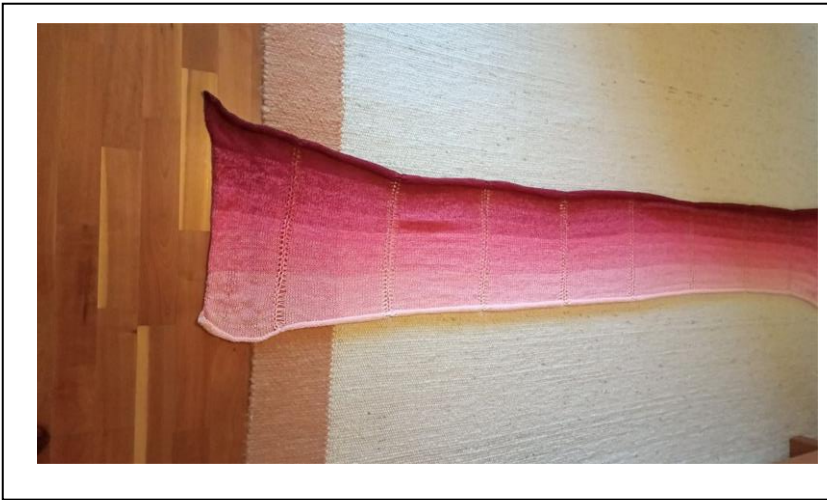
Made from “Woll Butt Alva” in colorway “beere”, probably 75 hours worth, material is 50 % Wool, 50 % Polyacryl , so can be washed in lukewarm water. Design by me. Very soft drape. Yarn cost €14,95