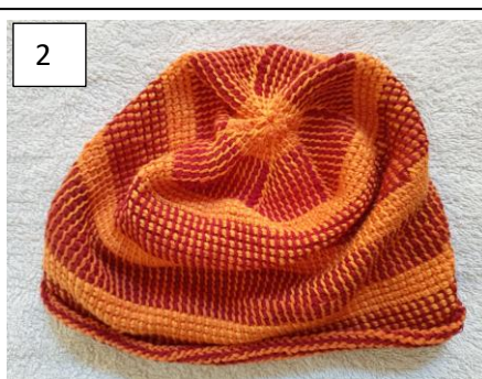
Organic viscose, middle female