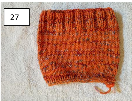
Convertible cowl/beanie, wool, K12 kid's size yarn cost € 3