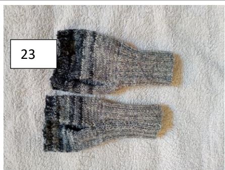
Size 40, D, Aloe-Vera-treated-eco-friendly wool, wool cost € 9;95