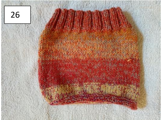
Convertible cowl/beanie, Alpaka + wool mix, very soft , female size or smaller men's