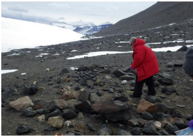
Asgaard Hut: 2017-18