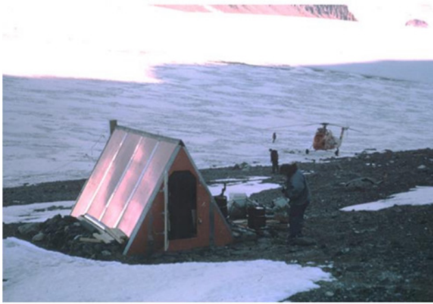
Asgaard Hut: 1970-71