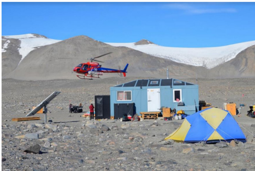
Figure 1. A typical semi-permanent field camp in the McMurdo Dry Valleys.

1957–1958. Since the IGY, scientific activity has continued every austral summer, in addition to three winter stays. Scientists found microbial life in the soils, glaciers, and ice-covered lakes, resulting in a changed perspective, and the valleys came to be seen as a vulnerable ecosystem rather than a ‘dead’ landscape. Many now consider the area a ‘natural laboratory’ for researching fundamental ecological processes. Ecologists and other environmental scientists, working out of field camps (Figure 1), study how nutrients cycle through this system in ways impossible elsewhere with far greater ecological complexity and longer histories of human presence.